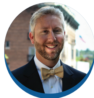
John M. Stone